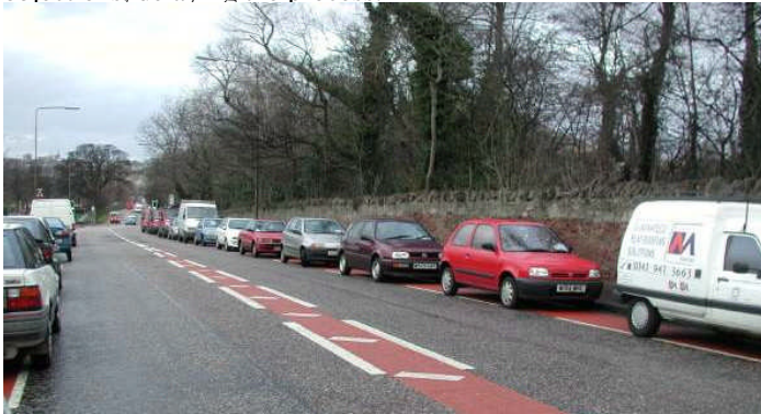
Old Dalkeith Road: spot the cycle lanes!

Parking in cycle lanes is a continuing bugbear, but we have had more complaints about lanes to the New Infirmary , Cameron Toll out to Fernieside, than anywhere else. Many health workers use this fast, uphill road, with sun in their eyes at some times of the year. We thank the many Spokes members who wrote to councillors about this. Thanks to you, the Council is preparing an Order to restrict parking! We don't yet have details but have asked for double-yellows on the whole route. A period of statutory consultation will follow and there could be objections, delaying the process.