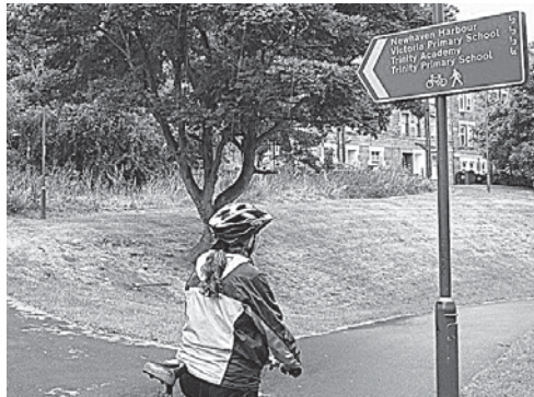
North Edinburgh signs - one of nearly 100 Sustrans Scotland 2004/5 projects, ranging from maps to new routes, funded by the Scottish Executive. "High standard, on budget and in tight timescales" said the Minister. So why the delay announcing the 05/06 money? See p7 [new minister] for how you can help!