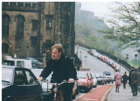
The Mound without parking - cyclist safety, walkers' wonderland, cars no worse jammed than usual!

How we won the Battle of the Mound - see page 5