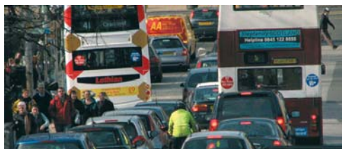
The Mound as the Council wanted to keep it - bus stops blocked, cyclists squeezed, pedestrians pressurised.

After a long struggle councillors plucked up their courage, rejected the official recommendation, and agreed to ban car parking on the Mound at all times. While this is not the most vital cycling issue in the city, we hope it is a sign that councillors are at last willing to take cycling more seriously. And that the Lib Dems - largest party on the Council - are serious about their manifesto promise of a 'model cycle-friendly and walking-friendly city' [Spokes 97 p5].