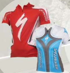
Specialized MTN Replica S/S tops