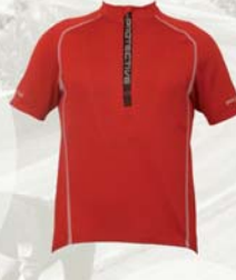
Protective Meino Short-Sleeved top