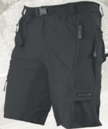
Endura Humvee Baggy Shorts