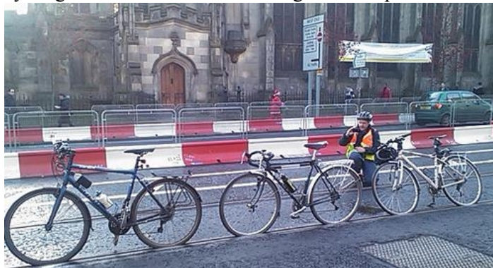
Tramline bike parking!!

Spokes has published a tramline cycling advice note . This and some other tram/bike documents can be found at www.spokes.org.uk/wordpress – downloads –tram. But detailed cycling advice is needed – we urge TIE to produce this.