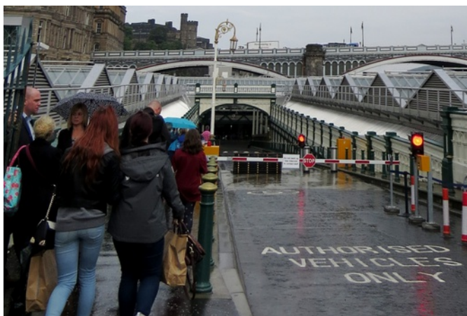
The Waverley Visitor Experience [north ramp]

prams, wheelchairs and luggage into narrow footways whilst wide adjacent roadways are empty except for occasional delivery vans. Please ask your MPs & MSPs to take this up. Full story: spokes.org.uk [July 4 news].