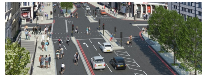
London proposed route at Ludgate

A huge challenge for the Council will be its Roseburn to Leith project. Will this be a bold main-road route like the London N-S and E-W superhighways now being consulted on [see 3.9.14 at http://cyclelondoncity.blogspot.co.uk ] or a back-street route with frequent turns, detours and even cobbles?