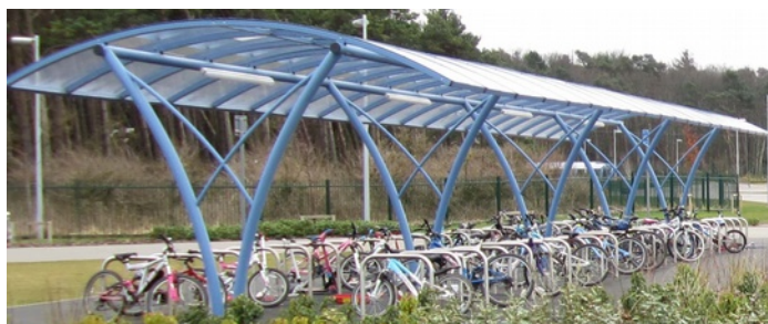
Dunbar Primary where over 50% of pupils regularly cycle to school

Smaller councils often don't invest much in cycling [p6] and so don't attract big match-funds. West Lothian is an exception, winning £1.8m for ten 2014/6 projects, more than any other Council except Edinburgh and Fife [Spokes 119]. And Livingston already has one of Britain's most extensive off-road cycle networks [buy our map to try it!]