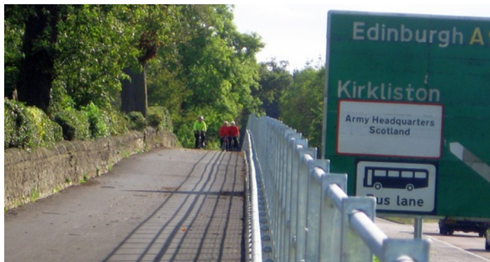
New A90 path at Burnshot

The council is getting big compliments from users for the latest sections of the above to be rebuilt. See the full story at spokes.org.uk : documents : local : Edinburgh : A90.