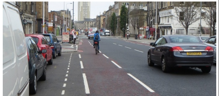
Leith Walk, north section

Work is nearly complete north of Pilrig Street. Sadly, the cycle lanes are onroad – and at risk of illegal parking. More positively, they are 1.75m instead of the usual 1.5m, have a marked 'door zone' beside parking bays and appear to have a