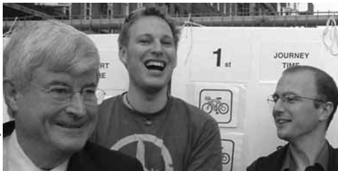
Commuters - like these, with Lothian MSP Robin Harper at TryCycling's commuter challenge - and families like below - all will benefit from the new Sustrans & SESTRAN money.

Holyrood Hustings 21 November Spokes autumn public meeting - see page 2