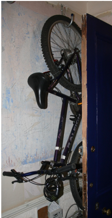
Ceiling hooks behind door

Where possible, the simplest way to avoid these problems is by storing the bike in your flat. Sometimes this can be fairly easy – for example with hooks or by choosing a Brompton or other fully-folding bike. Our notes will of course also cover in-stair, backgreen and onstreet/offsite options: storage in-flat is often impossible, so communal solutions are vital too.