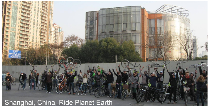
Shanghai, China, Ride Planet Earth