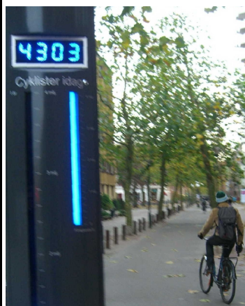
By Sep 2011: public bike counter

It will be delivered through two programmes, main road upgrades [A1, A7, A8, A90, etc] and area improvements [first being the already announced south-central Edinburgh corridor – see stop press opposite].