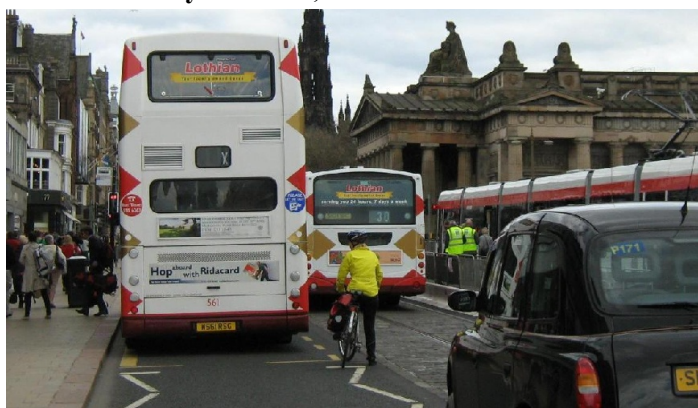
Princes Street tramlines and setts

The safety audit also recommends removal of setts, except inside the tramlines - vindicating our concerns [Spokes 107]. Ideally they'd come out entirely - they are yet another example of subjective 'Streetscape' dogma taking precedence over cycling policy and common sense . Traffic is to be banned from the area if trams arrive, but it remains a clear hazard e.g. if a cyclist is forced sideways, or other emergency. Already two crashes, one needing medical attention, have implicated the setts. A victim, who was nearly run over, said 'the cobbles are madness.'