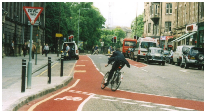
Red surfacing at Teviot Place: it works!!

Consultation on Edinburgh's first Quality Bike Corridor plans [Spokes 105] found 75% support; and work should begin late this year. Spokes is pleased with the post-consultation changes: notably a 20mph limit from West Mayfield to West Preston Street, wider bike lanes outside parked cars, and better KB access. Thanks if you wrote!