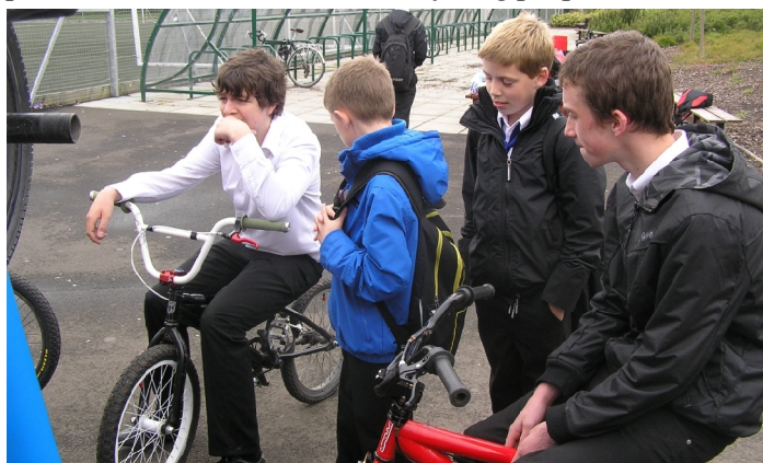
Firrhill lads take it easy at a Grease Monkey Dr Bike session ..... whilst the girls get in practice for Edinburgh potholes!

The 2011 Spokes Weans on Wheels project aimed to support parents making everyday journeys by bike with children too young to cycle independently. Spokes is now looking at older children who wish to cycle independently for local trips such as to friends, activities and school. The project focuses on practical aspects of everyday cycling, with a factsheet for parents out soon and materials for young people later.