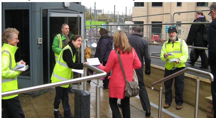
Spokes members leaflet 200 delegates about the budget as they arrive at the Sustainable Scotland Network conference where the Climate Change Minister was speaking

The budget process continues in Nov/Dec, with a probable final January vote. Please write now if you've not yet - the sooner you write the more likely you are to have an effect. Please send us useful replies so we can include relevant points on our website.