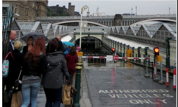
Pedestrian squeeze even without bikes or prams! broughtonspurtle.org.uk

The message to visitors is appalling: what other major European station would corral 2-way walking and cycling into a narrow passage, leaving a wide adjacent roadway virtually empty!