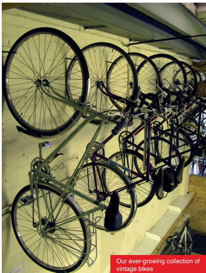
Our ever-growing collection of vintage bikes