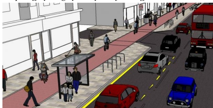
Artist's impression from Edinburgh's CL+ bid

Edinburgh's bid is a cycling corridor from the City Centre to the city's west edge, building on the Council's E-W proposal [p4], integrated with major generators of local travel and with rail and tram, and focused on “ people who are put off cycling by heavy and fast traffic. ”