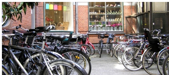
Shopping in the City