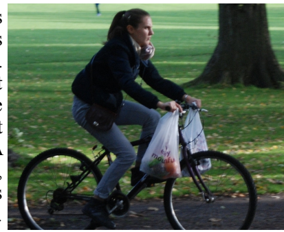
A balanced shop! edinburghcyclechic.wordpress.com