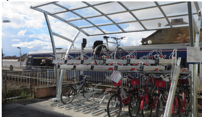
Hire bikes and one of 3 new bike shelters at Linlithgow DdF

Abellio ScotRail are fulfilling their promises, with much improved bike parking at many stations, and bike hire at ten, including Haymarket, Glasgow Central, Linlithgow and Stirling. More is planned, including a Bike Hub at Waverley. See www.bikeandgo.co.uk – locations - for an up-to-date UK-wide bike hire stations list.