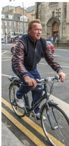
Terminator Arnie visits Edinburgh and tries Lothian Road - the wrong way!!

"We've a Spokes map pinned up at our canteen entry. I often see colleagues looking at it - I recommend it for any office!"