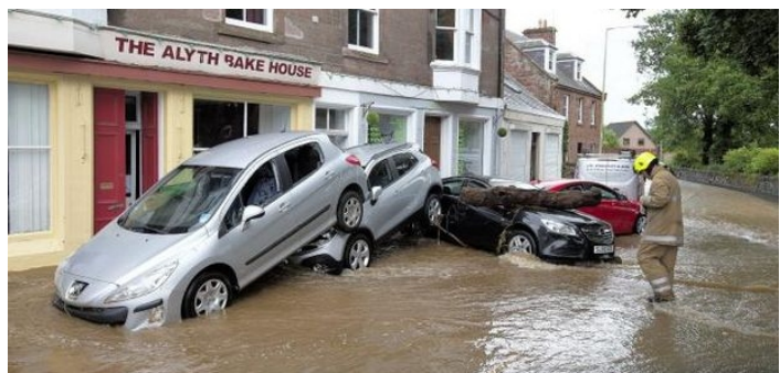
Floods across Scotland – aftermath in Perthshire [July 2015]