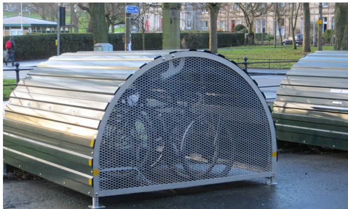
On-street secure storage unit, Lonsdale Terrace

Because of tenement bike storage problems the Council has experimented since 2014 with secure on-street units and renting out the keys. The initial 51 spaces were greatly oversubscribed, with 90 people on a waiting list, and interest from people in 53 streets. To get on the list or suggest new streets email cycling@edinburgh.gov.uk .