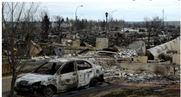
Canada wildfires – Fort McMurray, a town of 80,000 people, is evacuated and 2500 homes destroyed [May 2016]