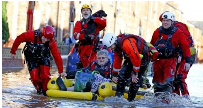
Storm Desmond hits Scotland & North East England [Dec 2015]