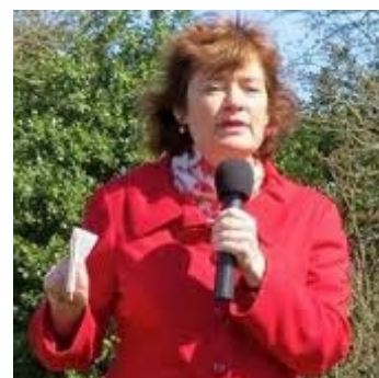
Sarah Boyack MSP