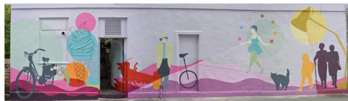
Gifford Park mural on the new Meadows-Innocent route