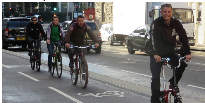
Buccleuch Street segregated link

Just 2 adjectives from users on citycyclingedinburgh.info about the completed Innocent-Meadows route, with its segregated sections on busier roads [and a mural - see p8]. A similar-style continuation to the canal is due in 2016.