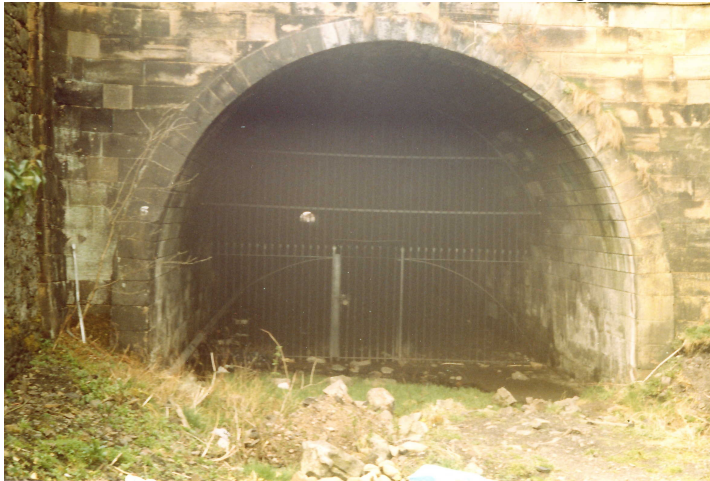
The magnificent Innocent railway tunnel - as it was!!