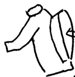
Jacket in profile

Thanks for entering — Encourage your friends to enter too! Details also at: www.spokes.org.uk