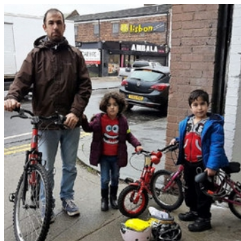
The good Bikes for Refugees