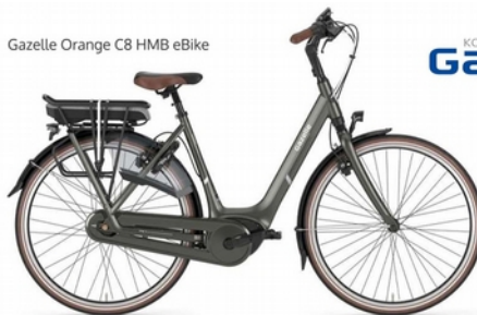
Gazelle Orange C8 HMB eBike