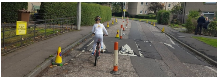
Featherhall Avenue trial

The big point here is that this hugely valuable low-cost trial only happened thanks to the Locality. If you see a similar opportunity in your area, try to persuade your councillors to raise it at your Locality Committee.