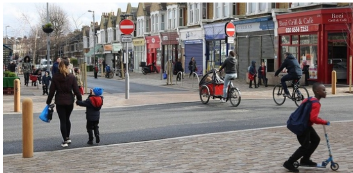
Waltham Forest Mini-Holland