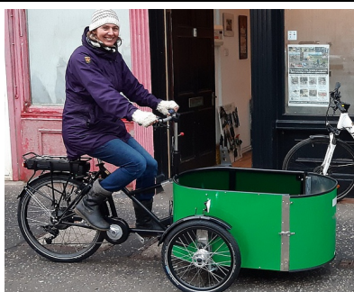
Spokes-supported Nihola cargobike for The Green Team - environmental work and education with young people