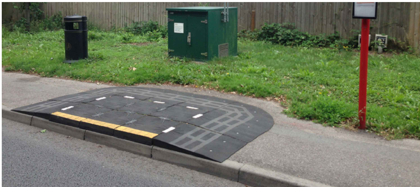
REDIWELD BUSPAD - TO BE LOCATED ON CARRIAGEWAY WHERE STATED SEE DRAWING COM-12727-1100-01 FOR CONSTRUCTION DETAILS http://www.rediweldtraffic.co.uk/products/inclusive-mobility/buspad/