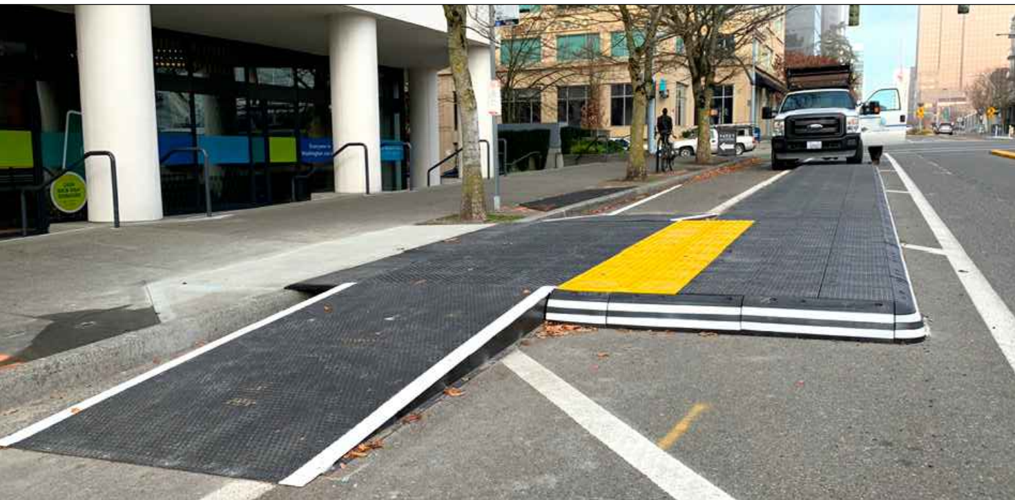
VECTORIAL FLOATING BUS STOP - ONE TO BE LOCATED NEW CAMUS AVE - OTHERWISE REDIWELD BUSPADS SEE DRAWING COM-12727-1100-01 FOR CONSTRUCTION DETAILS https://www.zicla.com/en/vectorial-system/