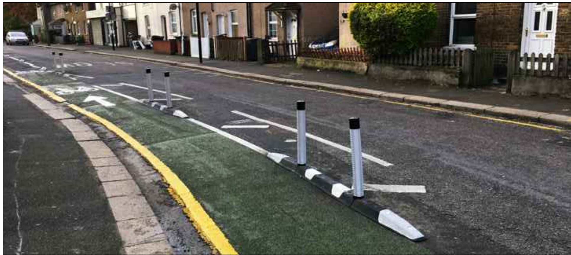
GREENWICH ORCA WANDS - 2.5m LONG SEE DRAWING COM-12727-1100-01 FOR CONSTRUCTION DETAILS http://www.rediweldtraffic.co.uk/products/cycle-lane-products/greenwich-wand-orca/