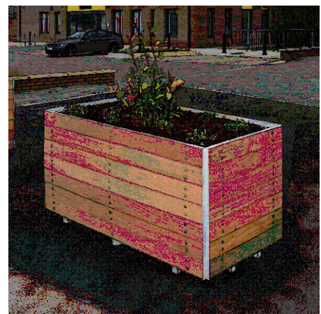
KIRKHOLT PLANTER SEE DRAWING ARB-12727-1100-01 FOR CONSTRUCTION DETAILS https://www.broxap.com/kirkholt-planter.html