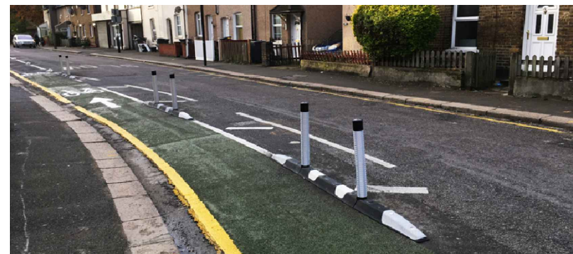
GREENWICH ORCA WANDS - 2.5m LONG SEE DRAWING ARB-12727-1100-01 FOR CONSTRUCTION DETAILS http://www.rediweldtraffic.co.uk/products/cycle-lane-products/greenwich-wand-orca/