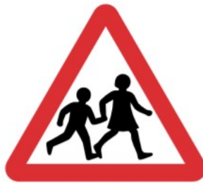
Figure 8-6 Diagram 545 (S2-2-25) Children going to or from school or playground ahead

At column numbers circled in red, the following signs should be erected onto the columns to highlight the crossing points of nursery children accessing the forest kindergartens across the city: