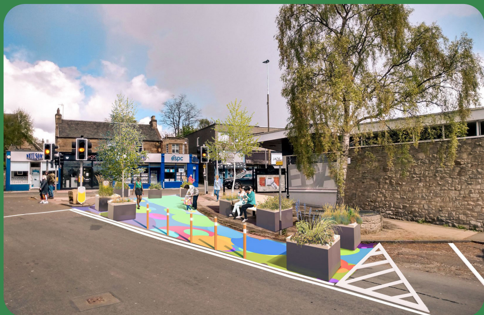
Visualisation on Manse Road at St John's Road