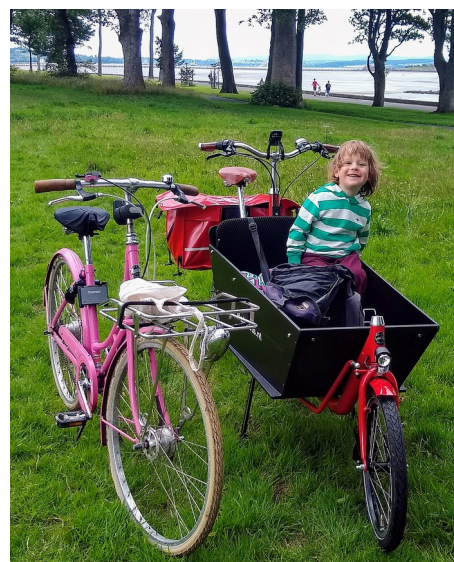
Spokes-supported family cargobike under a previous Spokes offer. See more at www.spokes.org.uk/documents/advice/cargo-bikes