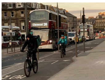
Much more cash for projects like this

We don't know how the increase will be phased between now and 2024. The ideal (and sensible) approach would be annual rises of around £70m, meaning initially a rise from £115m in 21/22 to £185m in the 22/23 budget, which is expected in December.