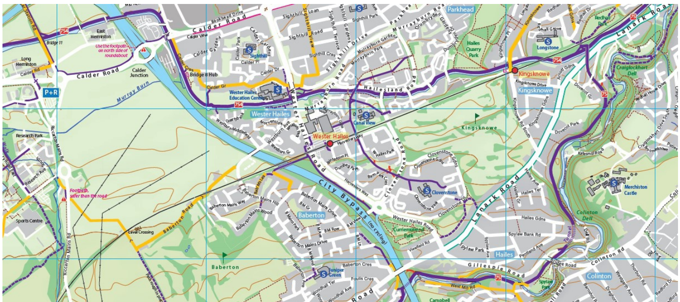
Extract from the new Edinburgh Spokes map