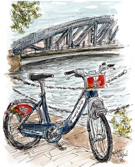
Lovely drawing by @edinsketcher

ActiveTravel@edinburgh.gov.uk with a subject line of Cycle Hire Scheme .