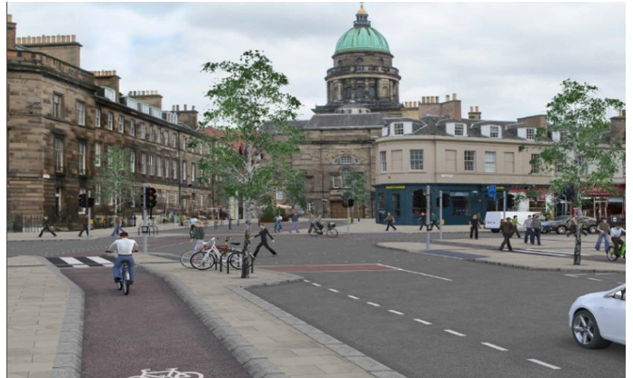
Melville Street CCWEL visualisation

If you use twitter, please retweet our tweet about the CCWEL story.