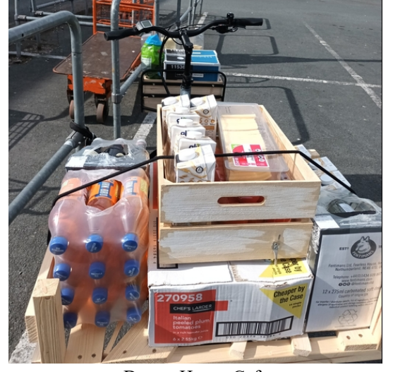
Dower House Cafe Tern cargobike supported by Spokes

Organisations should use the information sheet and application form on our <u>cargobike website page</u>. Spokes member households , please email Spokes explaining why you need a cargobike and how it will be used – generally grants will be first-come, first-served.