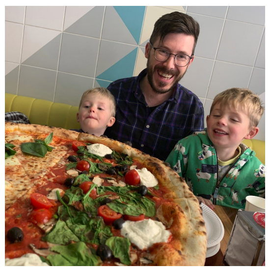
Enjoying their competition prize

Many thanks to all who helped organise the competition, to our prize donors – and, of course, to you if you entered!