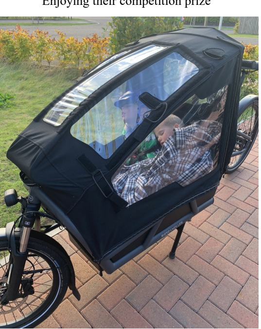
Returning home after pizza!

Next, we'll have to think of a great topic for our 2023 competition – ideas welcome !! We ideally need a topic which everyone can enter. So, for example, whilst school cycling is a really important issue it would not be an ideal topic for the competition.