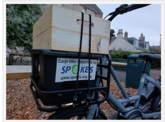
2022: £2000, Dower House Cafe , Tern Quikhaul cargobike [report] ; more pics 1 2 ;

Organisations should use the information sheet and application form on our cargobike website page . Spokes member households , please email Spokes explaining why you need a cargobike and how it will be used – generally grants will be first-come, first-served.