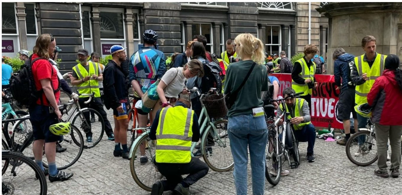
Bike checks at Spokes Bike Breakfast 2023...