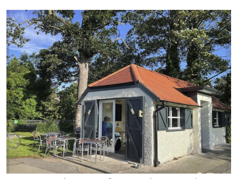
Rosebean Cafe, Roseburn Park