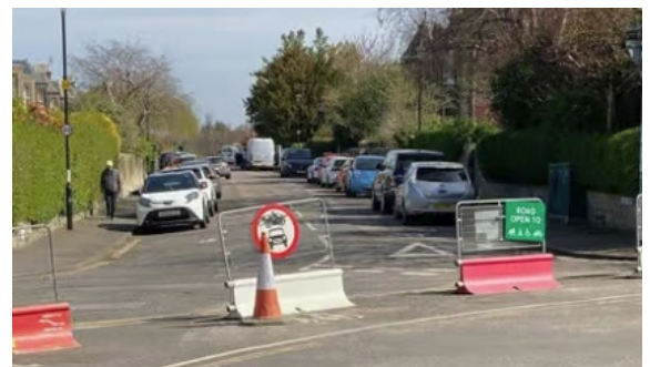
Braids Estate - will the filters remain and be made permanent?