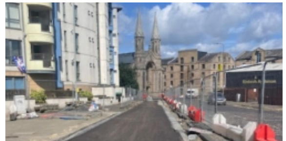
Foot of Walk to Dock Street, under construction.