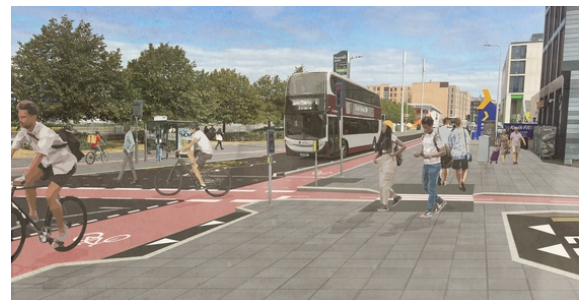
Dundee St/ Fountainbridge proposals