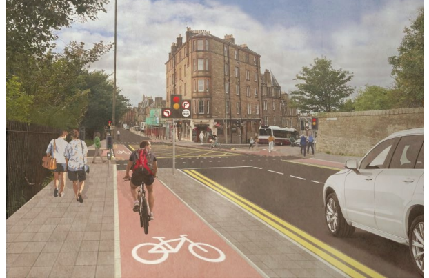
Visualisation at Angle Park Terrace. In future the scheme would be extended west along Slateford Road as part of the Council's Circulation Plan

The project will also be a welcome early demonstration of the Council's new Mobility Plan policy that the 'Primary Cycle Network' should largely comprise main road segregated bike lanes, which, it says, "are usually the most direct, flattest and socially safe routes."