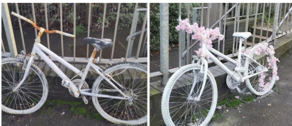
The Portobello junction ghost bike - before and after refresh by Infrasisters

Meanwhile, years after these deaths, interim safety improvements have been made at Portobello, but permanent solutions are still awaited here and at the West End. Speak to your councillors if this concerns you.