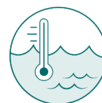
Marine heatwaves impacting Mediterranean biodiversity