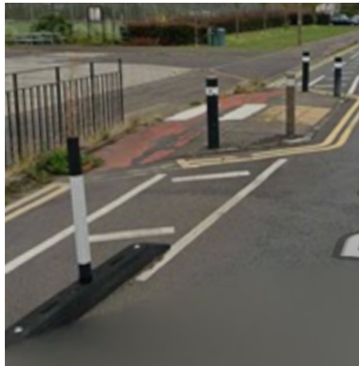
Duddingston Rd build-out, with zebra cycle crossing