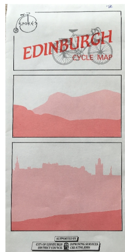
1st edition Edinburgh

And in Linlithgow we are experimenting with a maps article in a local door-to-door magazine, incorporating a £1 off voucher on any Spokes map at local bookshop, Far From the Madding Crowd .