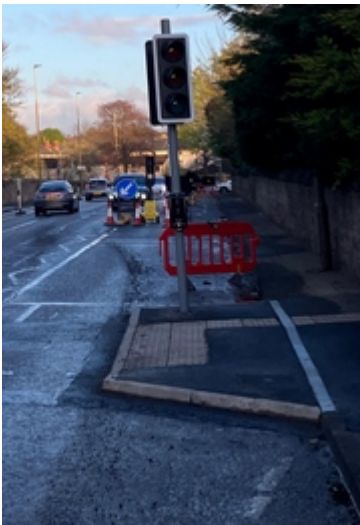
The Gilmerton Road build-out under construction

Obviously Spokes is very supportive of improved pedestrian facilities, especially here on a route to school, but there are alternative designs which could cater both for walking and cycling safety, some of which have been implemented by the Council at other locations (though no location is identical and modifications might be needed). However, a solution which enables cyclists to continue along a protected cycleroute, not being forced into the traffic stream, is surely essential for locations on the Council's Primary Cycle Network.