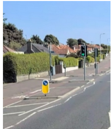
Build-out with continued cycleroute further along Gilmerton Rd