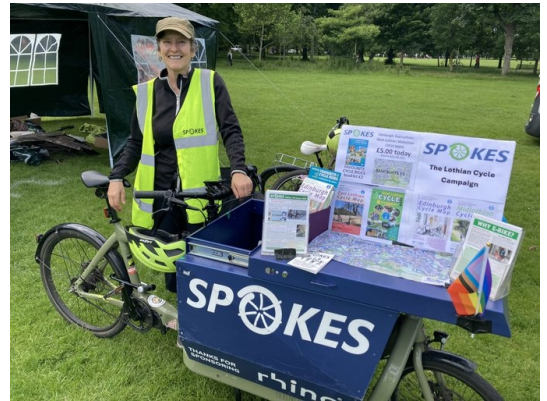
Spokes stall at 2025 Meadows Festival

Saturday 2pm – last Sat every month except December – Critical Mass community fun ride , also making a point.