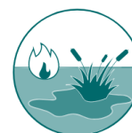
Peatland wildfires impacting biodiversity